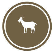
LIGHT BROWN GLAZE