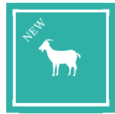
*LITTLE BILLY GOAT